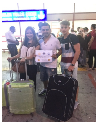
July 5 - 7 (Wednesday - Friday): ARRIVAL PROGRAMS of HOST FAMILIES (3 Days with Host Families)