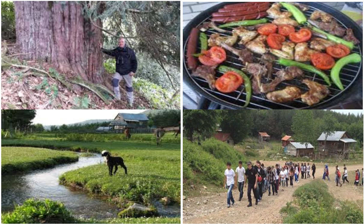
19:00 Students will be taken by their host families

09:00 Gümeli climbing & picnic: We have a bus trip about 2 hours , a wonderful barbecue party in nature , play games , visit the oldest Yew tree in the World which is 4112 years old.