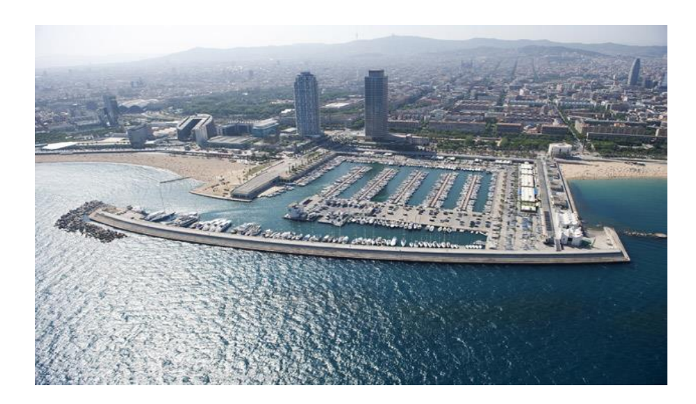
Saturday July 9: Meeting of all youngsters for sightseeing in Barcelona.

Dinner and overnight at InOut Hostel (Vallvidrera-Barcelona).