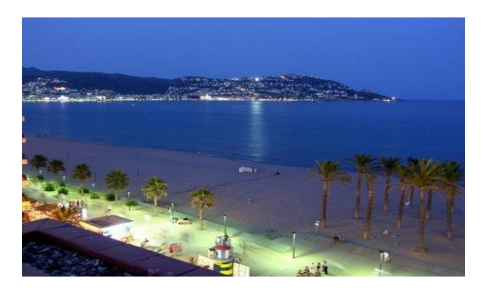
Wednesday 13 July: Recreational activities on the Estartit beach and snorkelling in Medes Islands.