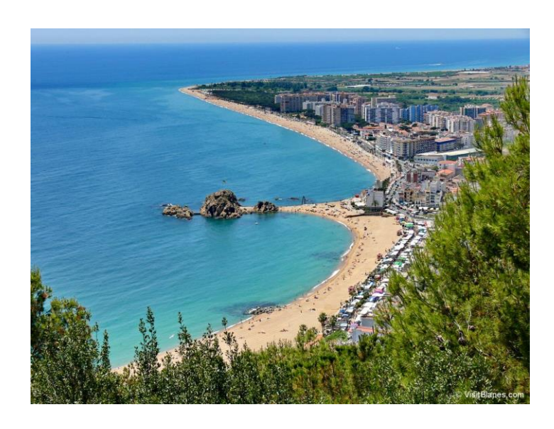
Friday, July 15: Arrival at Port Olímpic of Barcelona, collection of youngsters in InOut Hostel (Vallvidriera-Barcelona). Lunch in Inout Hostel.

Overnight on the boat. Night sail to Barcelona.