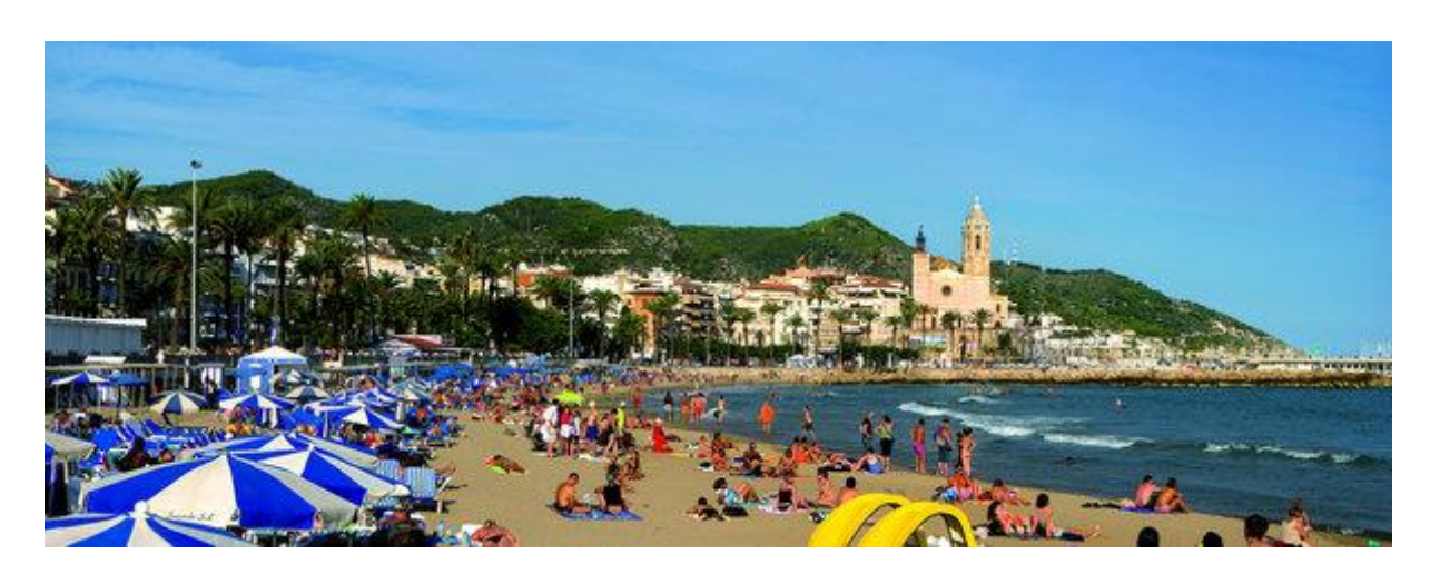
Tuesday, July 5: Arrival at the Marina in Tarragona. Recreational and tourist activities in the area. Visits to the Roman Tárraco Area.

Overnight on the boat. Night sail to Tarragona.