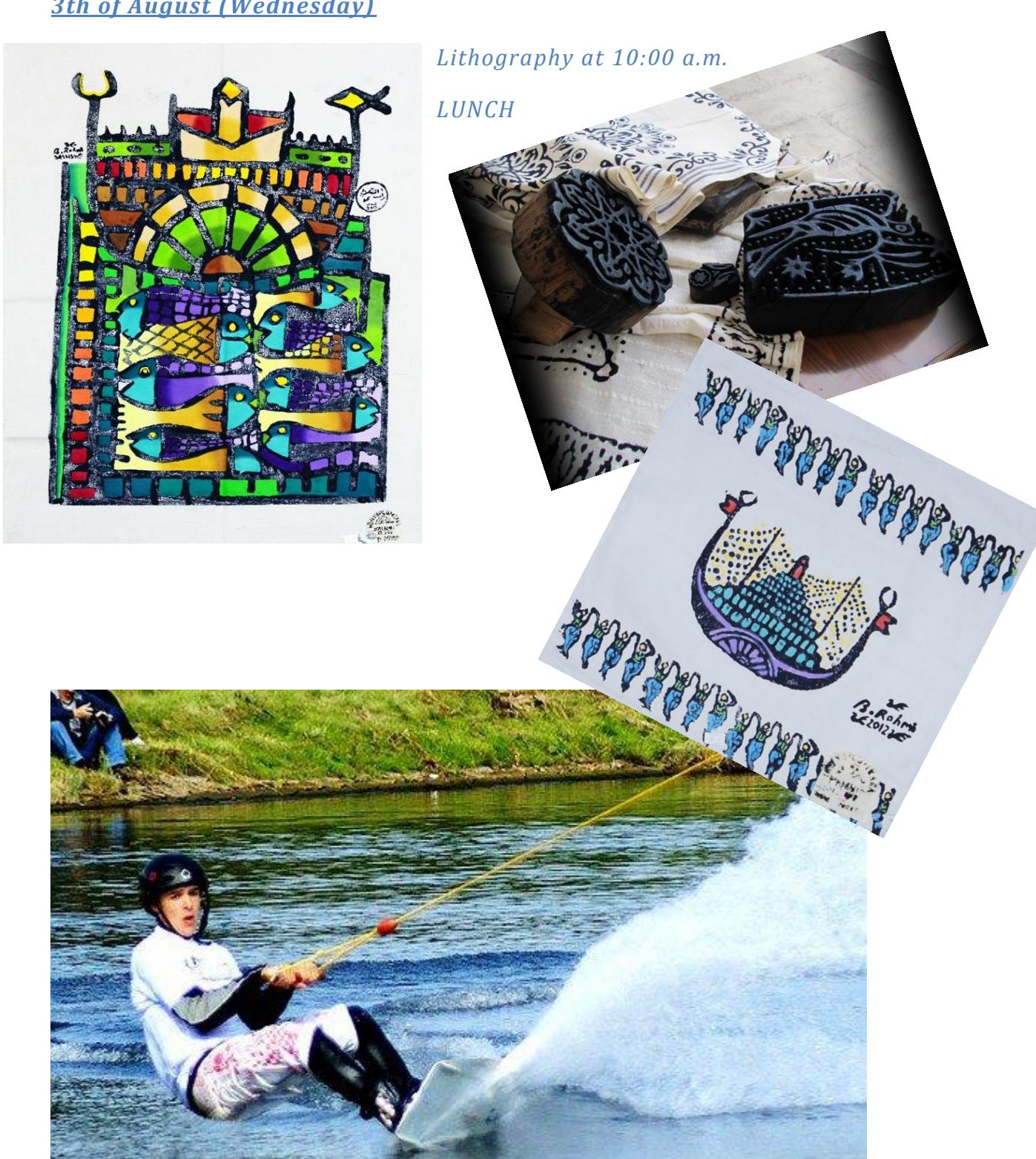
Water-ski and pool party