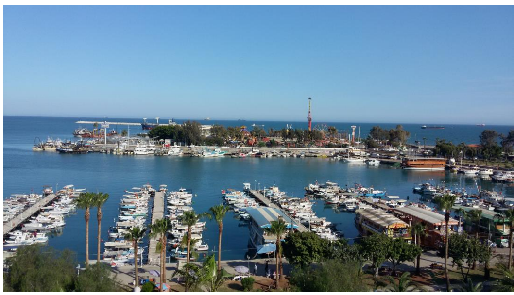
WELCOME TO MERSIN