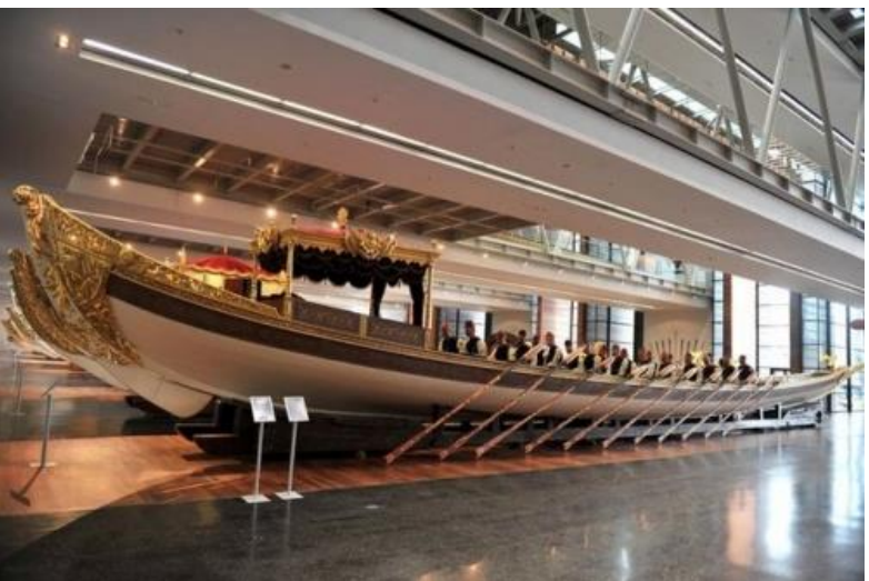
Museum of Marine