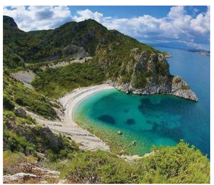
DILEK PENINSULA - II